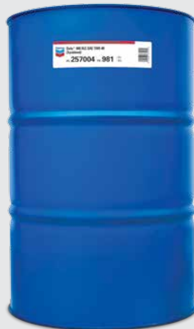
Delo 400 XLE SAE 15W-40